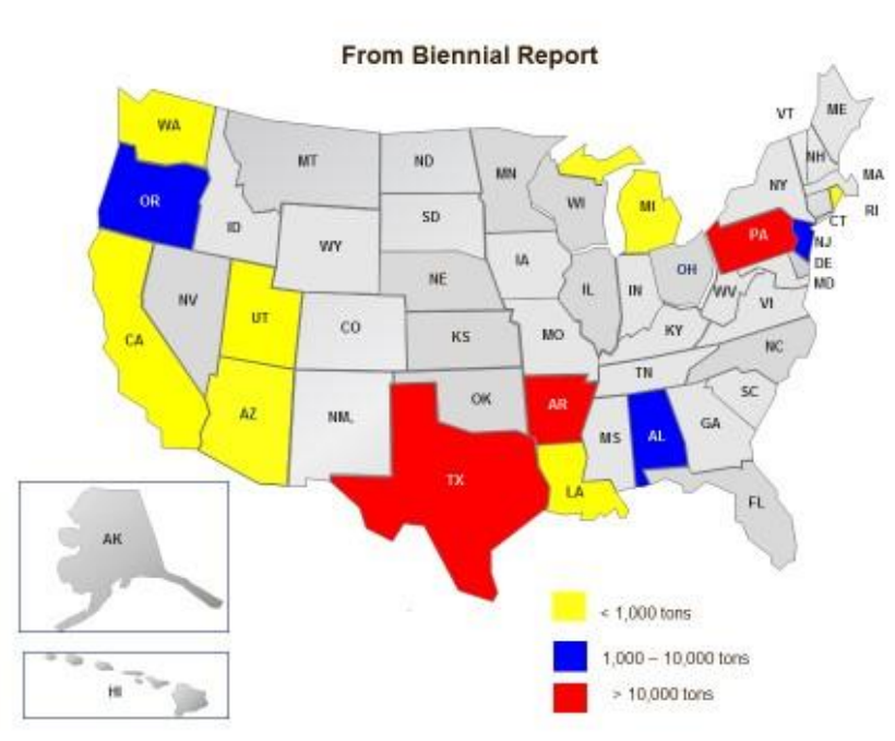
Figure 2 – 2009 Hazardous Waste Imports

data also showed much of the waste documented in the manifests received by OFA was not reported in the BR. Further, the BR and OFA data had major discrepancies. Figure 2 illustrates the major differences in the quantity of hazardous waste imported into the United States depending on which EPA data source is used. Specific state discrepancies are further illustrated in Figure 3.