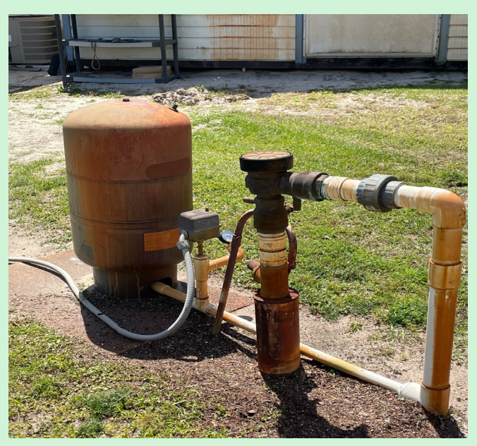
A well on the private facility's property within the delineation area. The brown staining is indicative of groundwater use in that area.

The EPA is not responsible for sampling these private wells for contaminants and had not done so at the time of our fieldwork. While the private facility owner could request assistance from county health officials in determining any health concerns related to the use of the wells, the RPM did not know whether the owner pursued this avenue and sampled the wells. It is important to note that, to our knowledge, the private facility owner followed appropriate processes to obtain permits for the wells on the owner's property. The groundwater delineation area functioned as designed, but not as the EPA intended. Using the groundwater delineation area as a governmental control to prevent groundwater use is a deterrent to many private property owners, but not all.