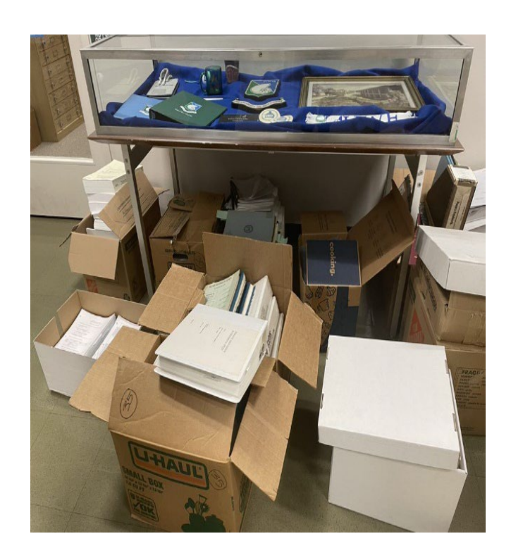
The ACW Superfund site's physical administrative record at the University of West Florida John C. Pace Library archive.

While the ACW Superfund site's repository contained a 2018 Community Involvement Plan , it did not contain documents demonstrating historical public participation in the different remedy decisions. The EPA's Revised Guidance on Compiling Administrative Records for CERCLA Response Actions states that the administrative record should "tell the story of a response action selection decision" and should include documents that collectively explain why the EPA chose the response actions at that site and that demonstrate public participation in those cleanup decisions. The ACW Superfund site's repository did not contain documents showing public participation in remedy decisions. The EPA did not include an index in the repository, which would have been beneficial in this instance because the information was not organized and catalogued, and the library database did not list the records it received from the EPA in the searchable inventory. Instead, as shown in the photograph, the documents were in the library's basement archive in various boxes that required the assistance of staff to retrieve and review.